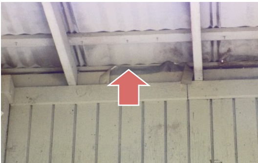
Common bat entry point to roof and walls

Of course, another option is attaching a bat-house to the exterior wall of the house, following our guidelines for bat-box construction and location. When you start seeing a few fecal pellets below the box, you’ll know that bats have moved in. One to three fresh pellets per night is one bat, so it is really obvious when you have a maternity colony of dozens of bats!