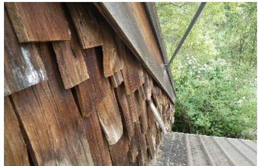
Exterior roosting and entry to interior