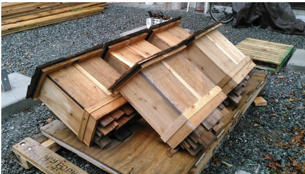
Kwiaht design: displaced-colony roosts built by Cascadia Homesteads, Orcas

The most important rule is simply this: use a bat house only as a last resort. Leave maternity colonies undisturbed if at all feasible. And while it may be tempting to mount a bat box as a way of “attracting” bats to a home where they do not already have a roost, you will be very lucky if one or two of the boys moves into it. Better to assume that grandmother bats have already found the best roosts in the neighborhood—and let them stay there.